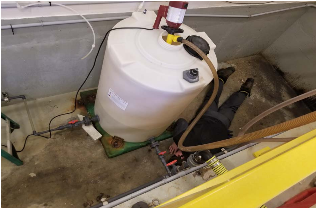
The Hawkins representative examining the scale nacelle prior to replacing the nacelle and the read out.