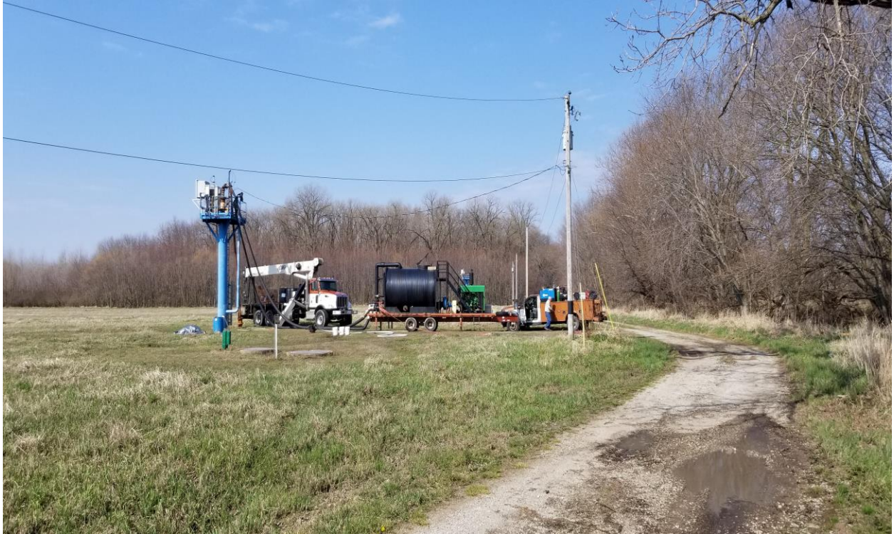
Brotke on site at well #2