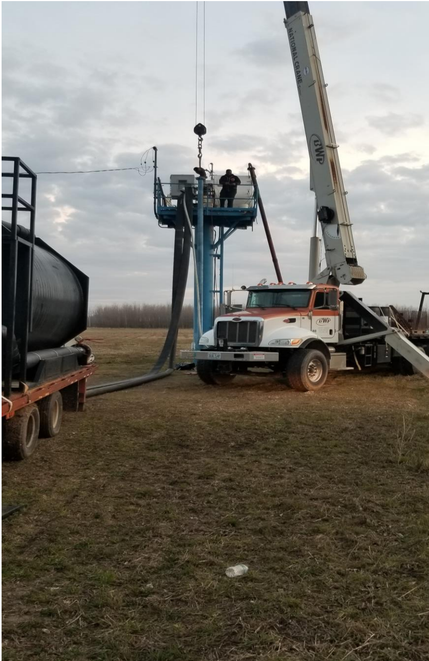
Brotke Cleaning well #2